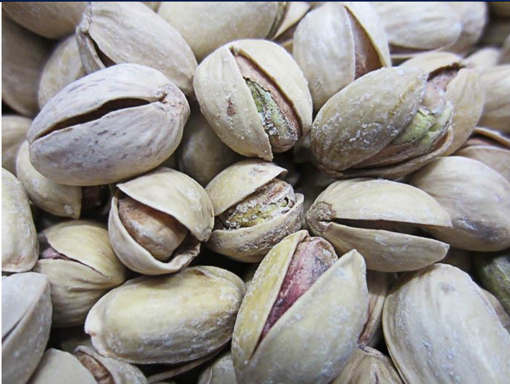
Typical Example of Raw Material