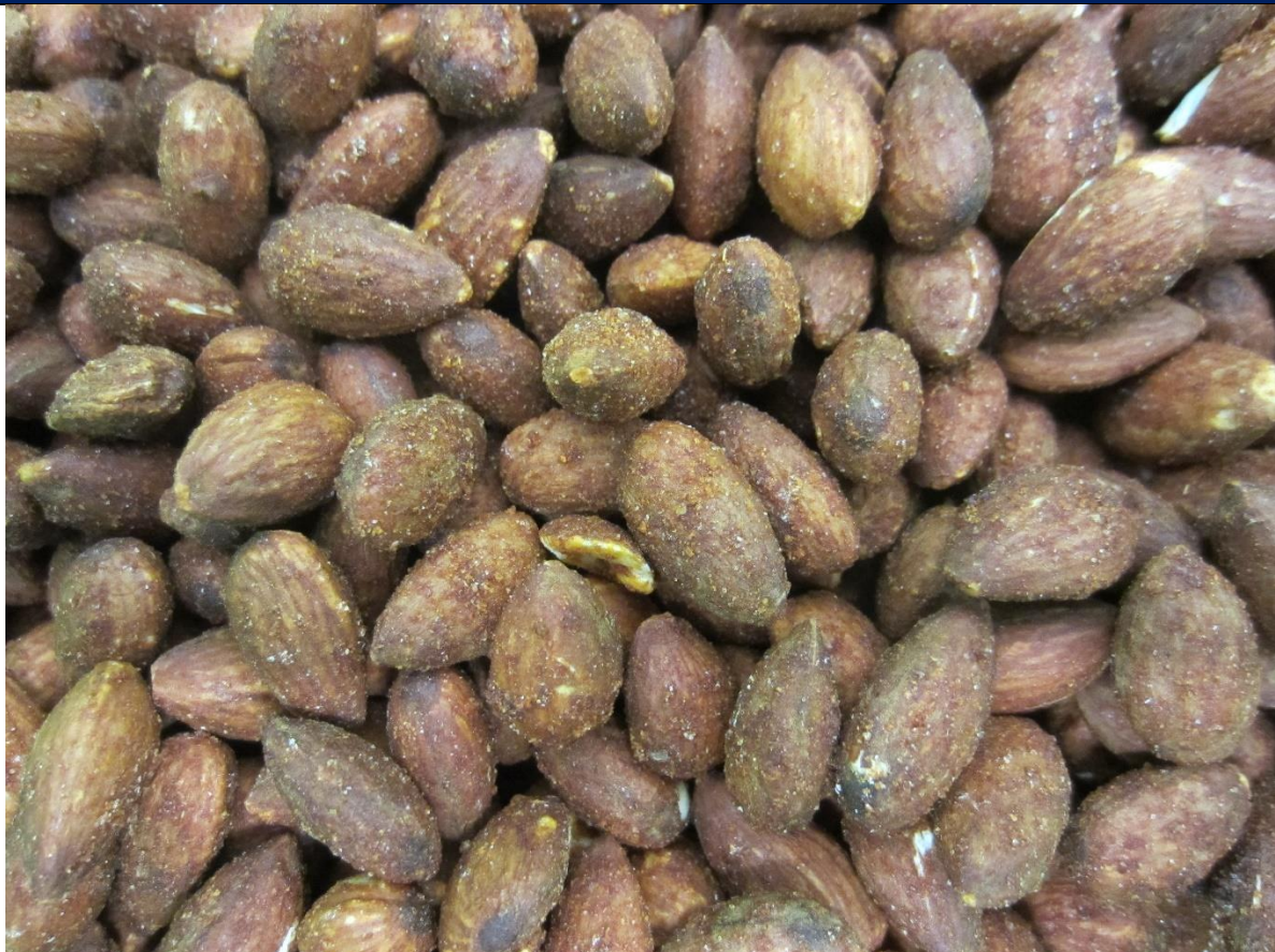
Typical Example of Raw Material