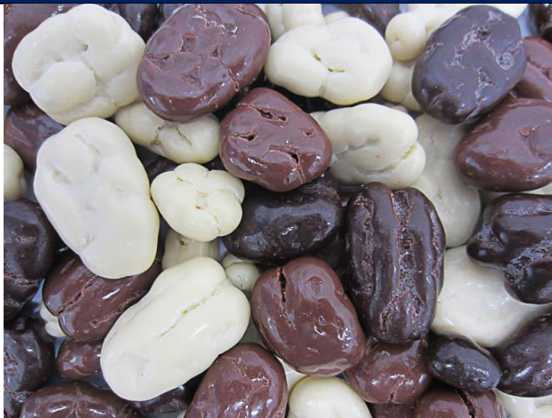
Typical Example of Raw Material