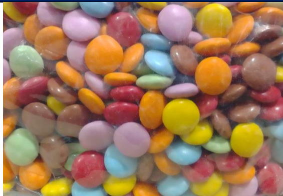
Typical Example of Raw Material