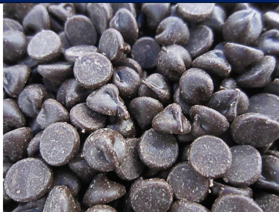
Typical Example of Raw Material