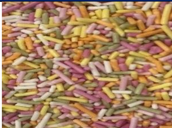
Typical Example of Raw Material