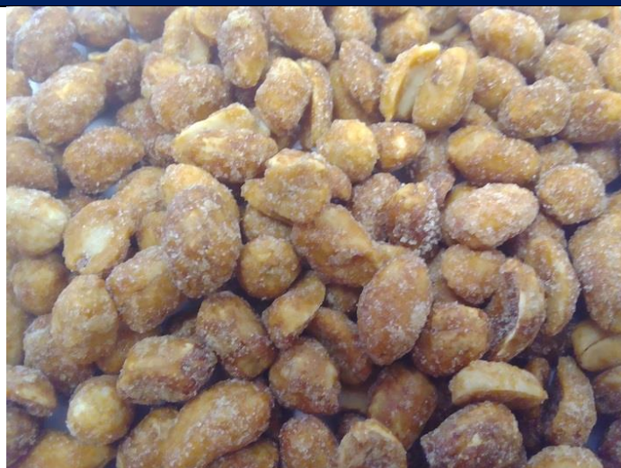
Typical Example of Raw Material